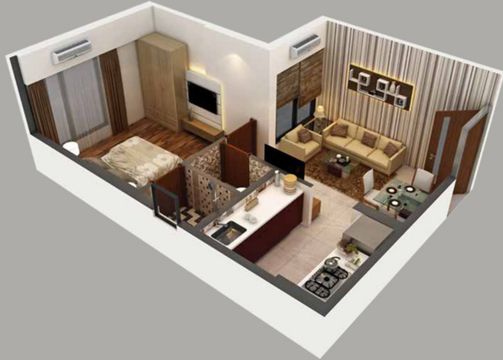
1 BHK unit plan - option 1