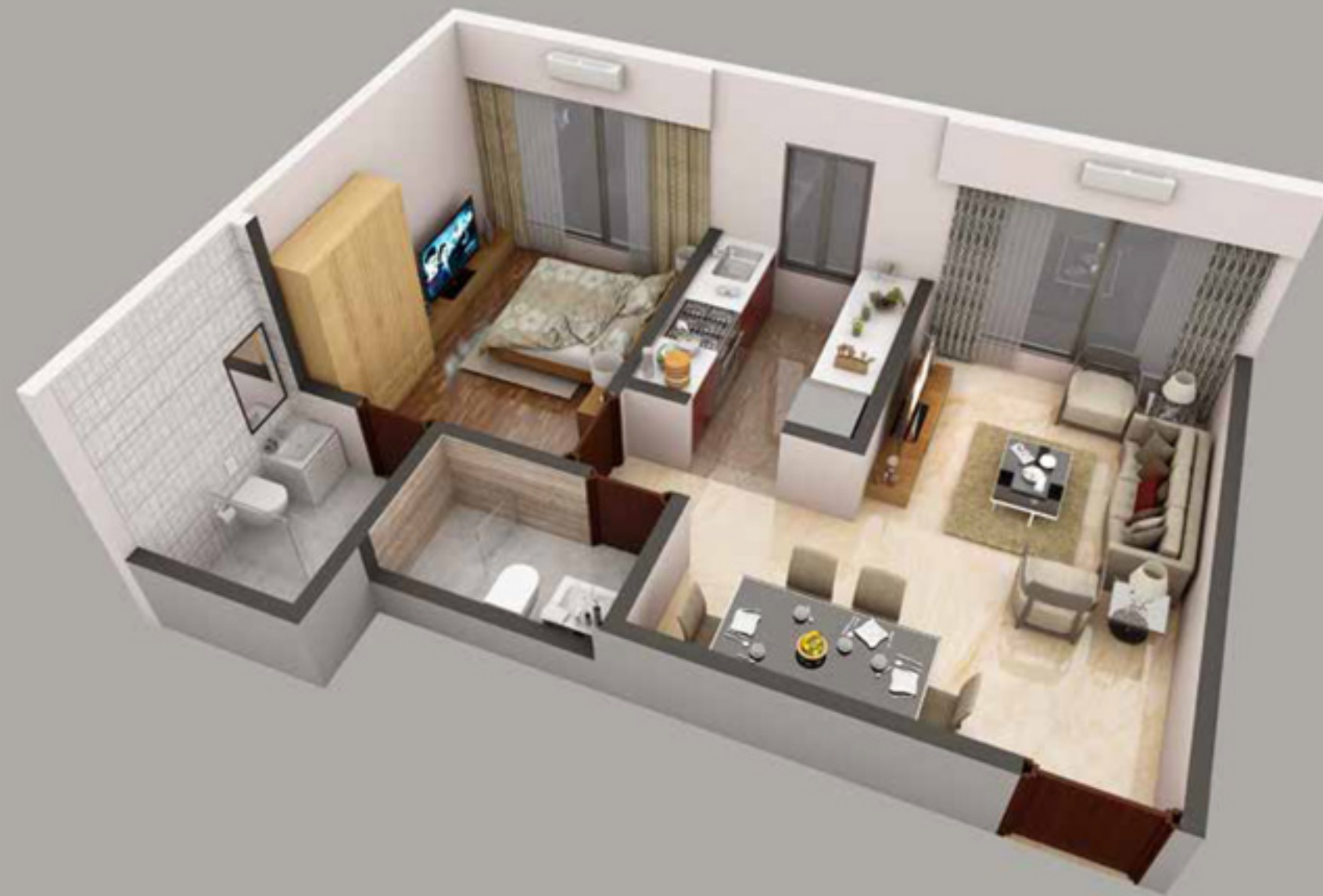
1 BHK unit plan - option 2