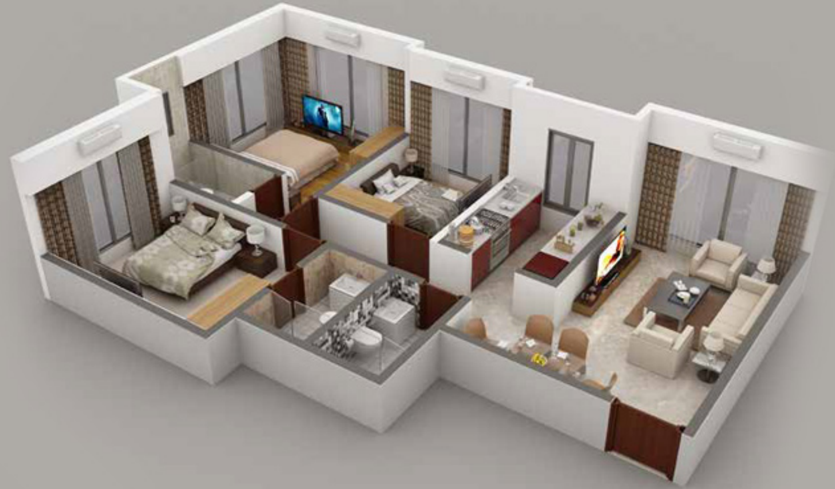
3 BHK unit plan