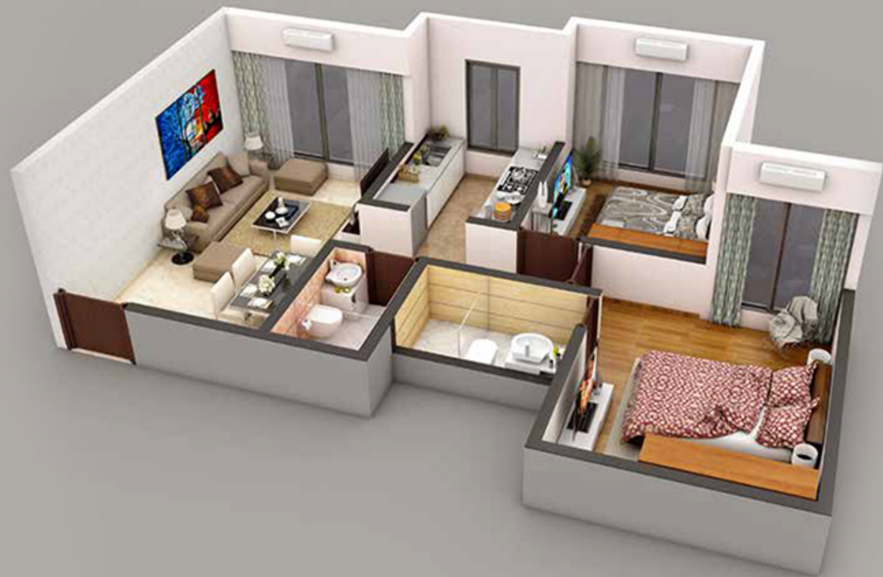
2 BHK unit plan